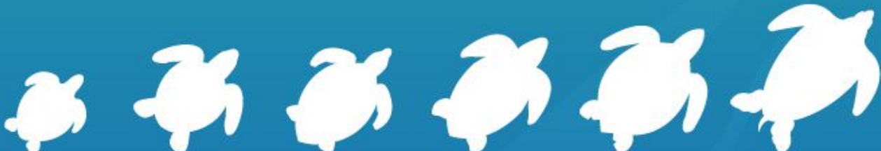
Olive ridley turtle (smallest)

The Great Barrier Reef is home to six of the world's seven marine turtle species.